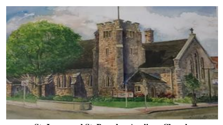
St. James and St. Brendan Anglican Church